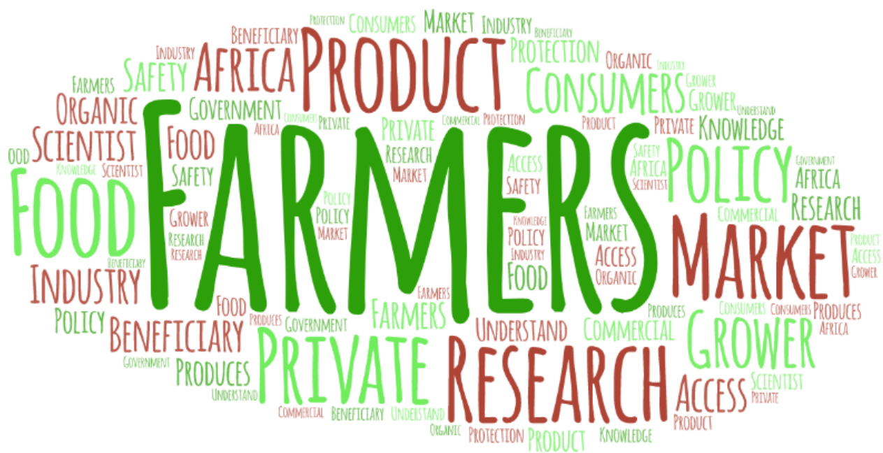
Figure 3: Word cloud based on survey answers on who would benefit from improved use of biologicals in African agriculture

From the pre-meeting survey it became clear that many of the participants associated themselves as working with biologicals as well as with biopesticides and botanicals which are similar, and the terms biologicals and biopesticides can even be used interchangeable, whereas botanicals (any plant derived material used in disease control) is a more narrow example of a biological.